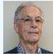
Treasurer Allan Boudreau Yarmouth Ret. NS Supreme Court Judge